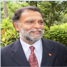
President AJAY PRAKASH

Finance Minister Nirmala Sitharaman raised the Tax Collection at Source (TCS) rate for foreign remittances under the Liberalized Remittance Scheme (LRS) from 5 per cent to 20 per cent . They will now be required to pay a higher tax. This will apply to overseas tour packages and other remittances except for education and medical purposes . TCS on remittances made under the LRS was introduced in 2020 . The purpose was to monitor the remittances made and to correlate these with the income tax returns of the persons who made the remittances. Presently, different rates of TCS apply depending on the nature of the transaction. There was also an annual limit of Rs 7 lakh on remittances which has now been removed . TCS is not a tax by itself, and credit for the amount of TCS paid on any transaction is available to the person who has paid the amount of TCS to adjust against their tax liability for the year.